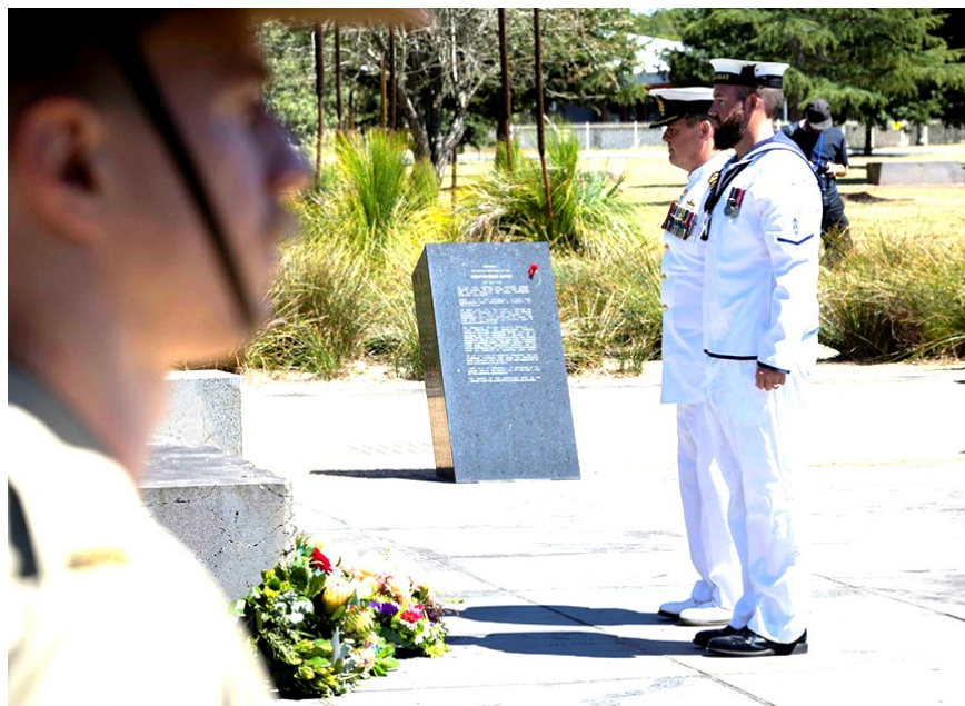
Above: His Excellency General the Honourable David Hurley AC DSC (Retd), Governor-General of the Commonwealth of Australia (right) and Councillor Des Hudson OAM, Mayor of the City of Ballarat, walk past the 36,400 names etched into the Australian Ex-Prisoner of War Memorial in Ballarat, Victoria.

The memorial stands as a testament to the pain and suffering endured by all prisoners of war, honouring the thousands of mates left behind and recognizing the sacrifices made by families during wartime. It displays 36,400 names of Australian ex-POWs on a 130-meter-long granite wall, serving as a powerful reminder of their courage and resilience.