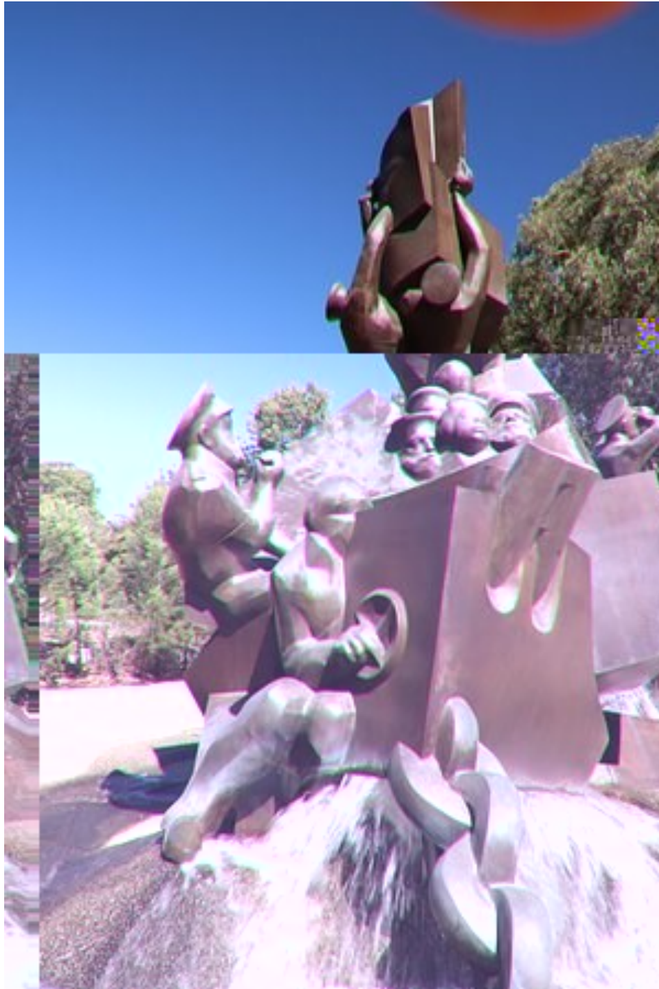
National Naval Memorial Canberra