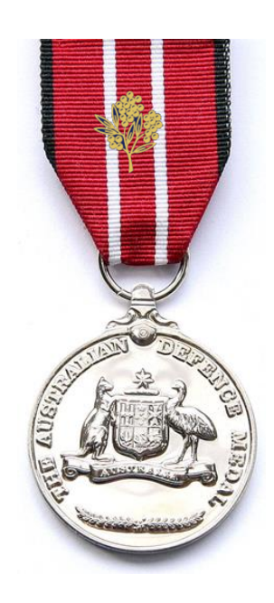
Incurred in Operational Service