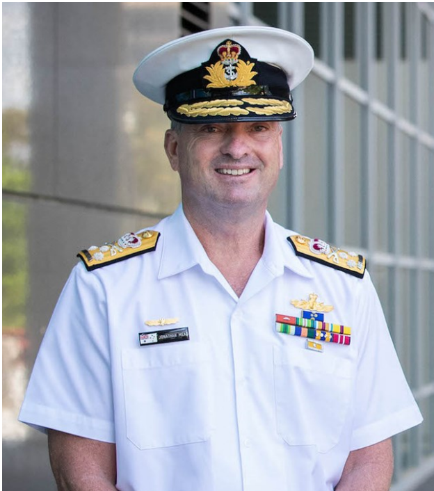
By Vice Admiral Jonathan Mead AO 30 October 2021

As Chief of the Nuclear Powered Submarine Taskforce my role is to advise Government on the optimal pathway to acquiring a fleet of nuclear-powered submarines for Australia. Nuclear-powered submarines will fundamentally change Australia's strategic personality in the maritime domain. They will allow us to hold potential adversaries at risk from a greater distance and influence their calculus of the costs involved in threatening Australia's interests. Nuclear-powered submarines have superior characteristics of stealth, speed, manoeuvrability, survivability, and almost limitless endurance compared to conventional submarines.