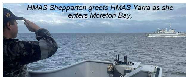
HMAS Shepparton greets HMAS Yarra as she enters Moreton Bay,

Two Navy MH-60R Seahawk helicopters and one commercially contracted AW-139 helicopter are located at HMAS Albatross in Nowra for search and rescue operations in day and night conditions in the greater Sydney and the South Coast region.