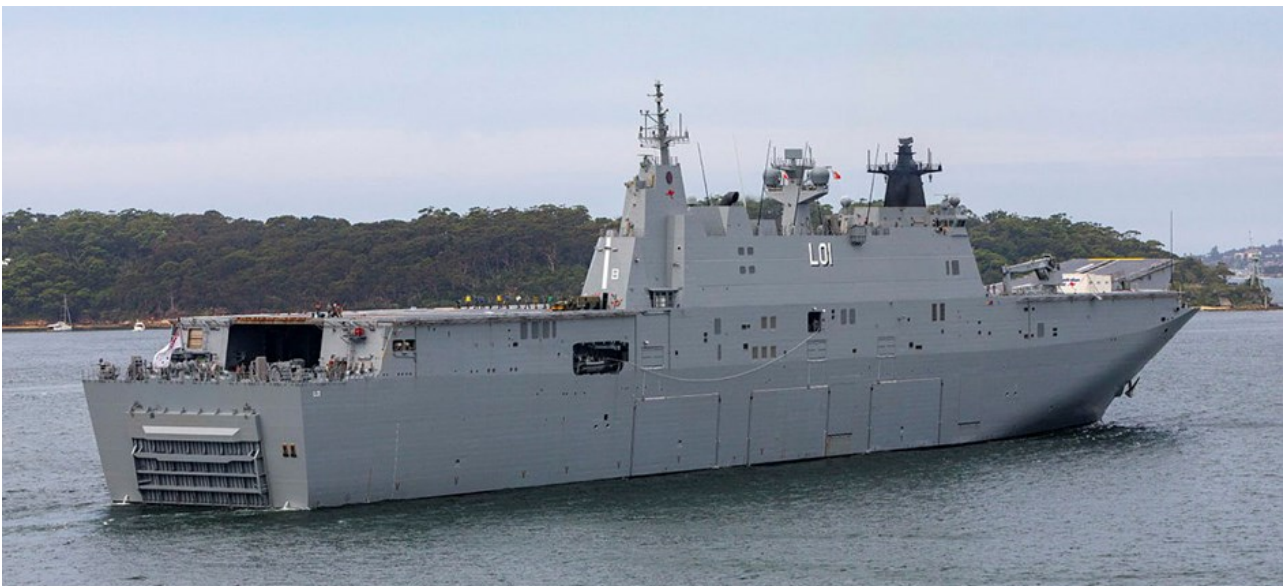
HMAS Adelaide departs Fleet Base East at Garden Island, Sydney. Defence is pre-positioning HMAS Adelaide to Brisbane to provide additional HADR support if requested by the Government of Tonga.