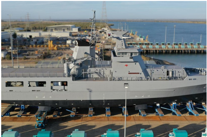
Arafura-class Offshore Patrol Vessel NUSHIP Arafura at Osborne Naval Shipyard in South Australia

The 80-metre long OPVs will primarily undertake constabulary missions and maritime patrol and response duties.