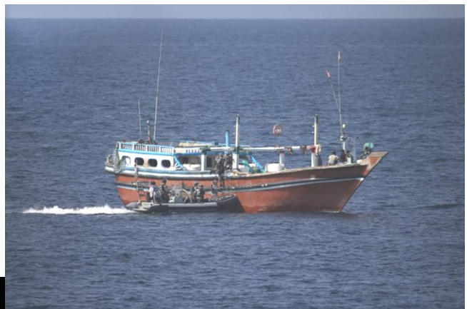
Above The boarding party from HMAS Toowoomba boards a dhow carrying a large amount of illicit substances during a patrol in the Gulf of Aden as part of Operation MANITOU on 19 March 2020

Imagery is available on the Navy Image Library: https://images.navy.gov.au/S20201210 .