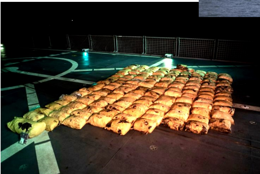
Left: 150 parcels of illicit drugs including hashish and heroin are made ready for destruction on the flight deck of HMAS Toowoomba after a successful boarding as part of Operation MANITOU on 19 March 2020.