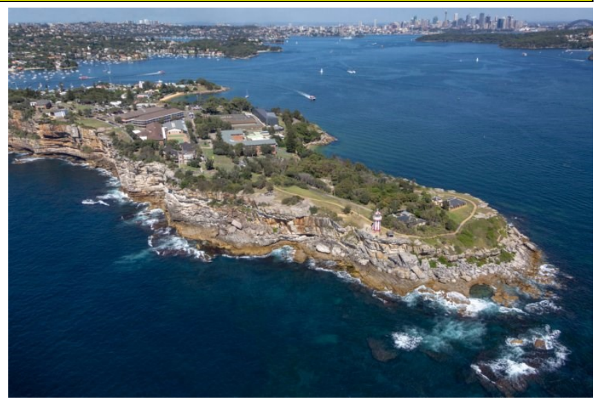
An aerial view of HMAS Watson, Sydney. Major redevelopment works are about to commence at Navy's principal warfare and navigation training establishment.

Watson was named after Watsons Bay, which in