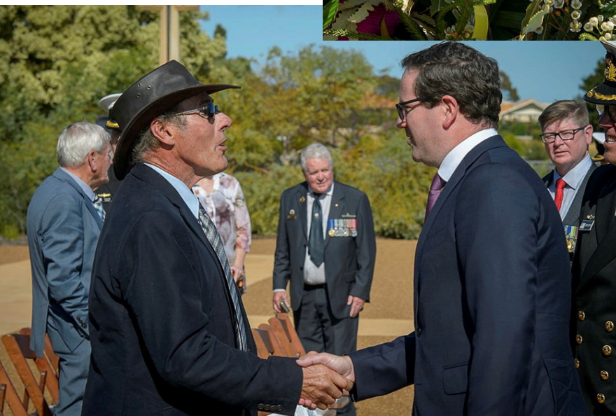
Text : From the Defence/RAN Website and the West Australian Newspaper/ Geraldton Guardian—27 June 2022