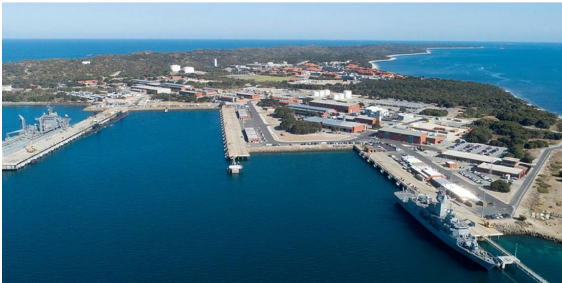
HMAS Stirling and Fleet Base West in Western Australia.

"This will allow Defence and Navy to not only develop a modern and exciting 21st century naval base, but also protect the stunning natural environment which is a jewel of Cockburn Sound, of which I am constantly amazed and proud to be a steward of. While I am unlikely to personally enjoy the combined benefits of the final outcome, it will be a dynamic, inspiring and modern workplace for someone like my daughter, who is also in the Navy, to serve in."