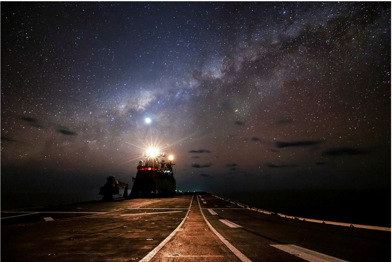
HMAS Canberra under the Milky Way while sailing back to Australian waters after the successful completion of Indo-Pacific Endeavour 21.

Australia has joined key partners India, Japan, the United States and the United Kingdom for the Maritime Partnership Exercise in the Indo-Pacific