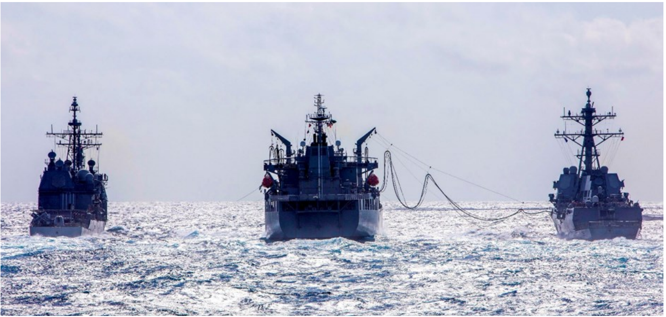
(l-r) USS Lake Champlain, HMAS Sirius and USS Stockdale conducts a replenishment at sea during Exercise Malabar, in the Indian Ocean.

Australia has joined key partners India, Japan, the United States and the United Kingdom for the Maritime Partnership Exercise in the Indo-Pacific