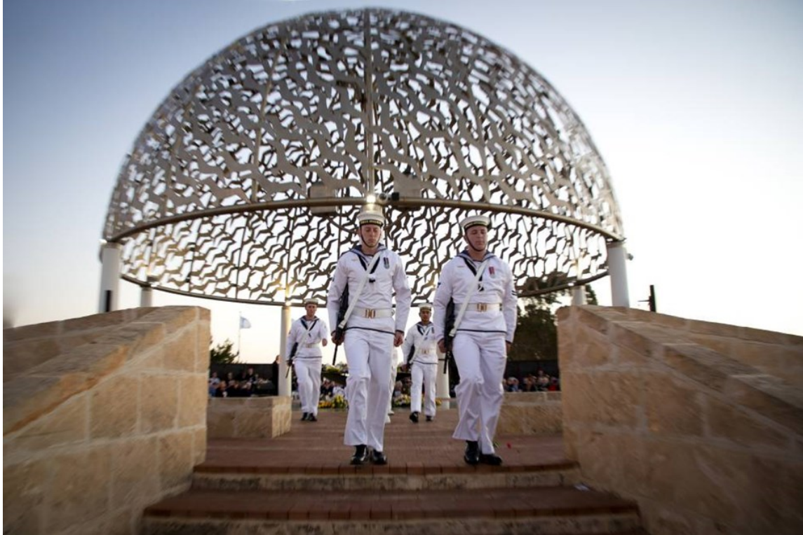
The catafalque party dismounts at the completion of a commemoration ceremony in Geraldton WA on 19 November 2021 to mark the 80 th anniversary of the sinking of HMAS Sydney II

When HMAS Sydney failed to return to Fremantle a major search for the ship began; but only a single Carley Float (on display in the Australian War Memorial) and an inflated RAN lifejacket were found.