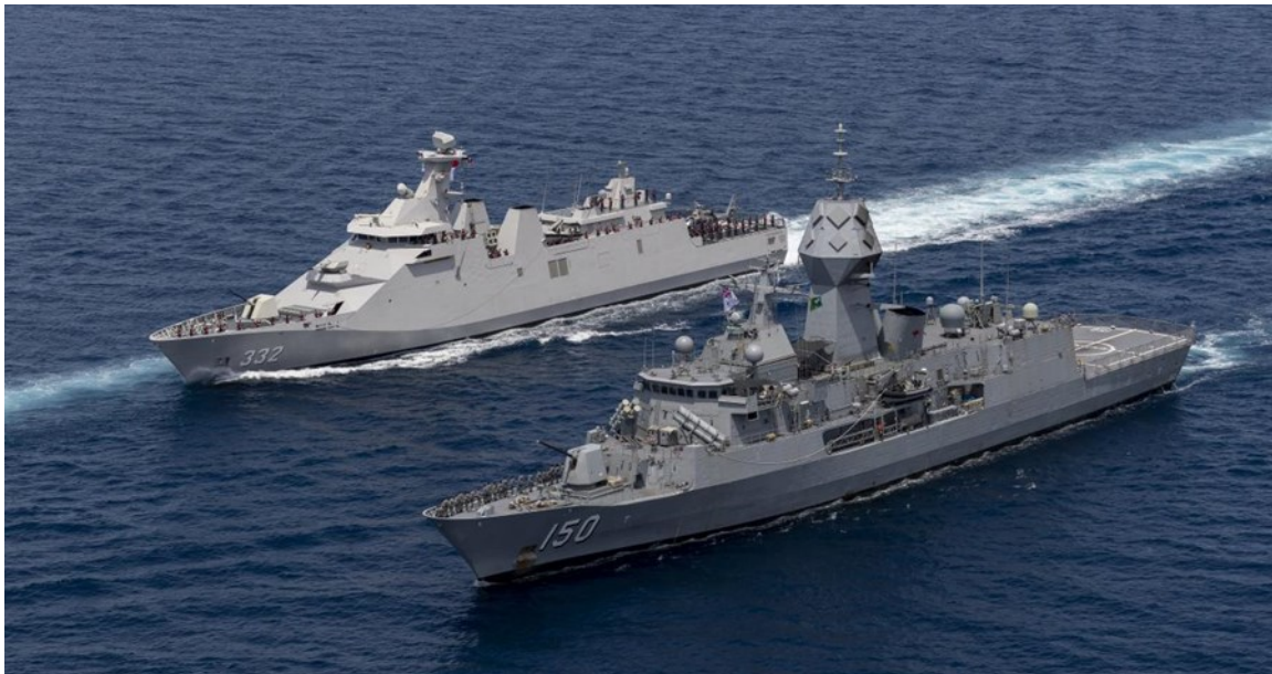
Indonesian navy ships KRI Gusti Ngurah Rai in KRI Malahayati's wake and HMAS Anzac sail in company during Exercise New Horizon.

HMAS Anzac trained with two Indonesian Navy ships this month during Exercise New Horizon, a key biennial maritime high-end warfare engagement.