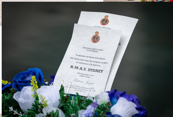
Above: Jim Quick lays wreath