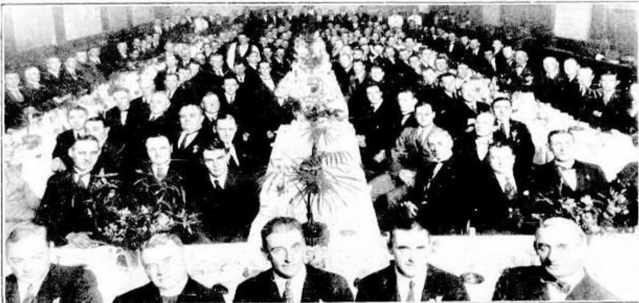
Ex-Navalmen's Association Smoke Night Manchester Unity Hall Melbourne 16 July 1925