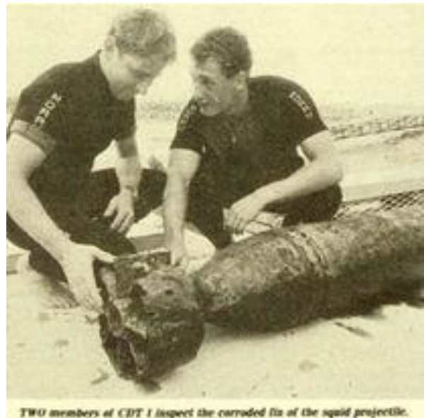
TWO members of CDT 1 inspect the corroded fin of the squid projectile.