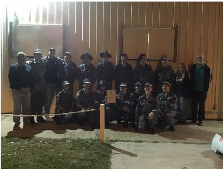
TS Norfolk Ships Company with the Award Certificate