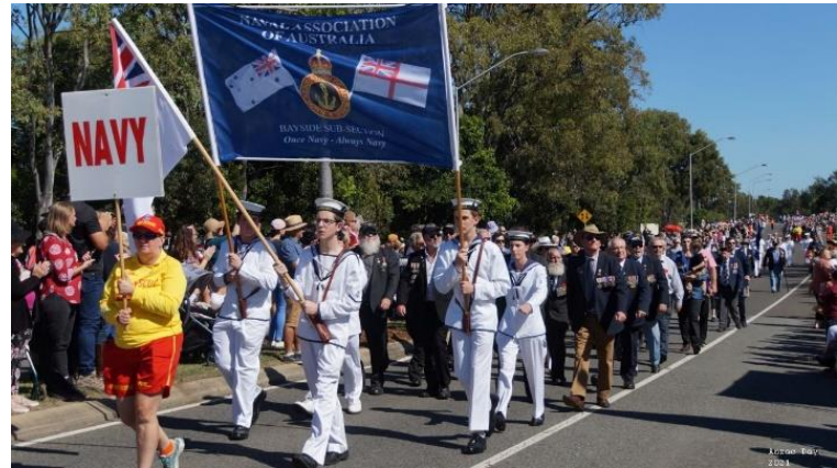
The NAVY Contingent Flags and Banner of the Bayside Subsection proudly carried by TS Norfolk Cadets

Before I sign off, I want to say how good the TS Norfolk cadets were at both the Dawn and Main Services on Catafalque party duties, being our banner and Ensign bearers and the participation in the Main March. Thank you and congratulations boys and girls you all did an outstanding job.