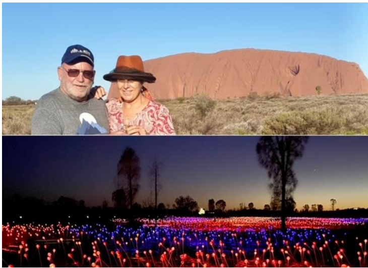
Living the dream at the Rock