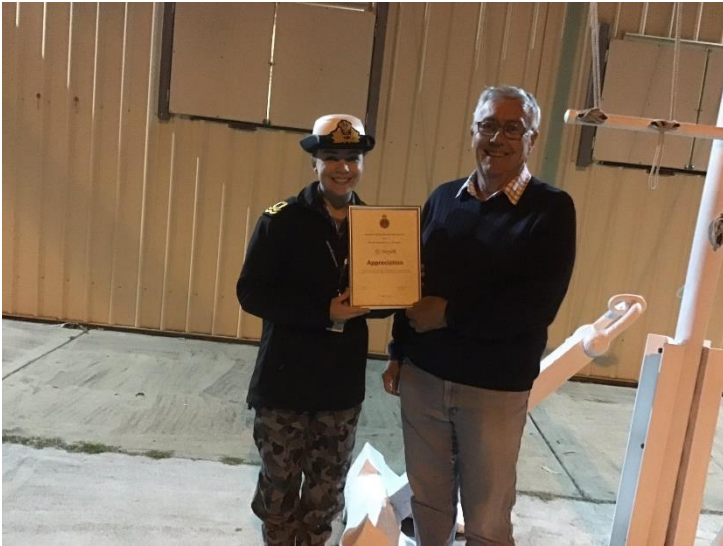
Col with the CO TS Norfolk and Award Certificate