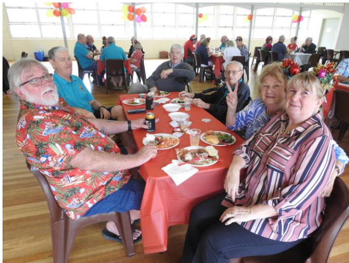
Tables set up to comply with Covid Safe