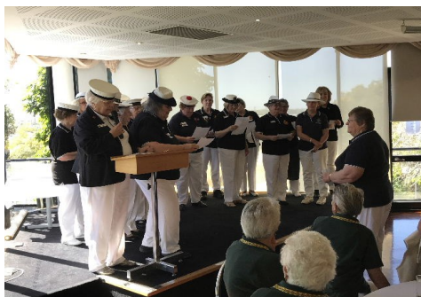
Our choristers in action

On Sunday 12 August at Geebung-Zillmere RSL, Navy Women (WRANS-RAN) Qld boasted one of our largest ever delegations to the Tri Service lunch. Our cadre of twenty ladies outnumbered those of the WRAAC and WRAAF by at least two to one and made ourselves the butt of many jokes by blitzing the raffles. Many of our ladies went home with a prize - or two - tucked into their bag.