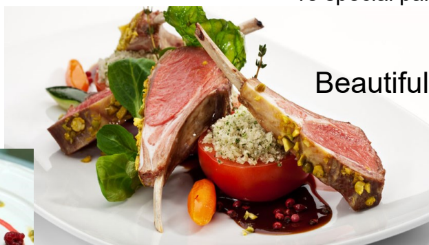
Beautiful 2 course lunch