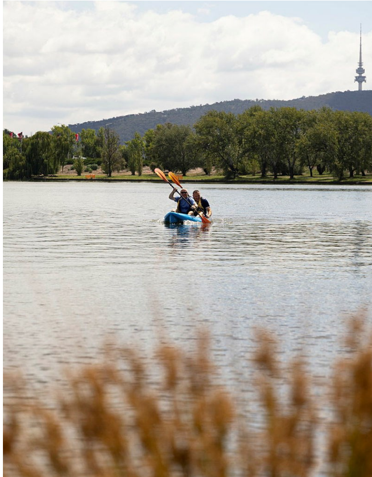
Maritime Urban Quest participants take part in the kayak challenge during the quest around Lake Burley Griffin, Canberra