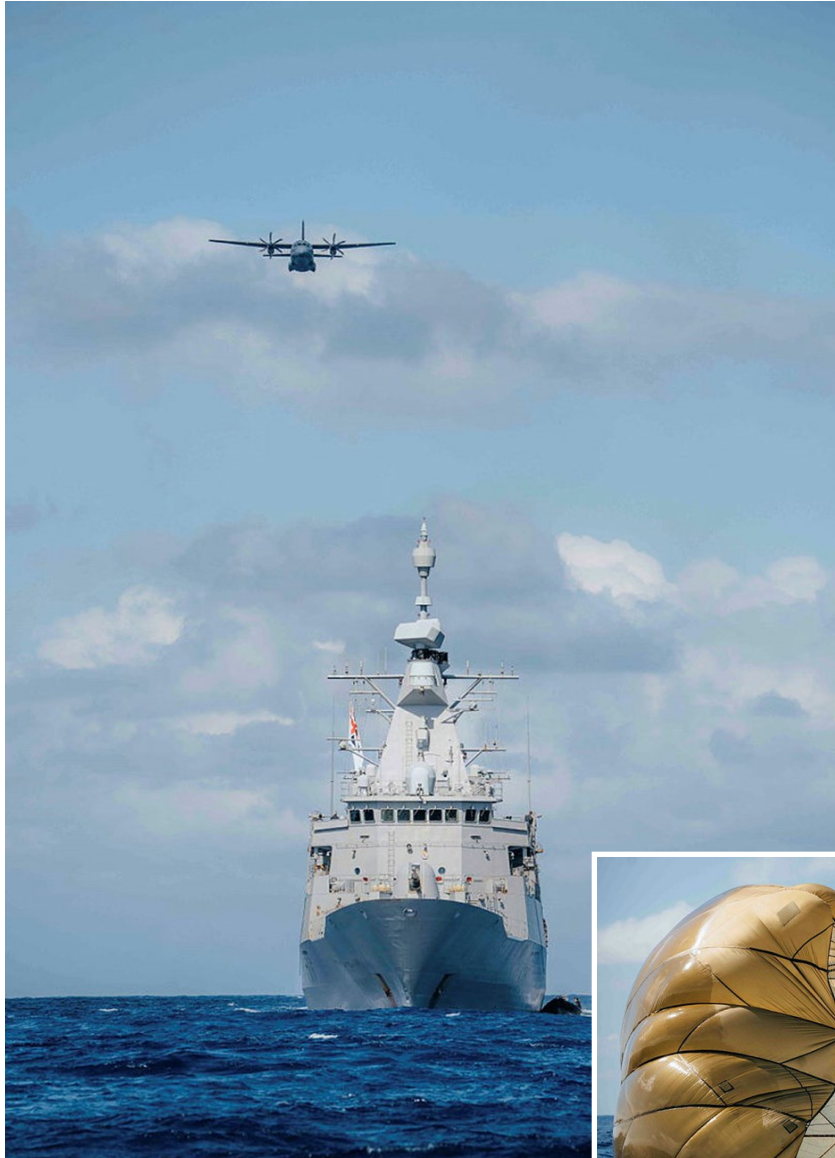
A RAAF C-27J Spartan makes a Maritime Air Delivery (MAD) to HMNZS Te Kaha off the coast of Queensland, Australia during Exercise Talisman Sabre 2025.