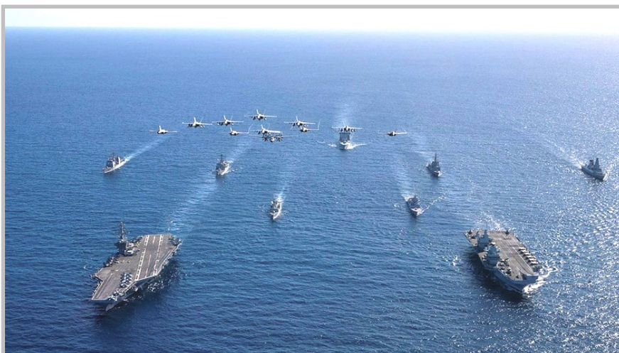
Above: Ships front to back: Norwegian warship HNoMS Roald Amundsen, HMS Prince of Wales, Australian warship HMAS Sydney, with an F-35B taking off from HMS Prince of Wales.

And with high-end amphibious warfighting just over the horizon, these Battle Groups are now ready for the next stage of the Exercise.