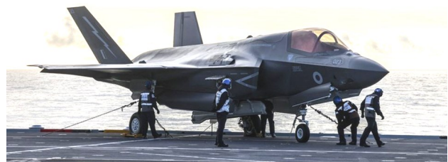
Above: RN F-35B Lightning fighter

More than 3,000 UK personnel are taking part in Talisman Sabre, the largest military exercise Australia has ever hosted, with the participation of 19 countries in total, including the United States.