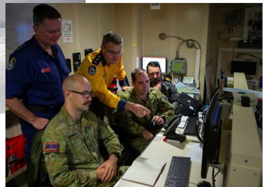
Below: Members of the NSW Police, Rural Firefighting Service and the ADF Amphibious Task Group work together in the Joint Operations Room onboard HMAS Adelaide