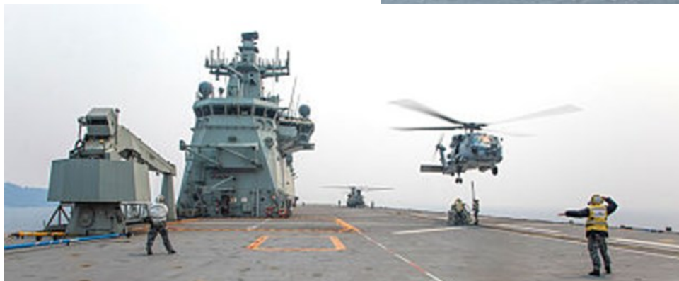
Below An RAN MH-60R Seahawk 'Romeo' Helicopter conducts a vertical stores lift with Adelaide. RNZAF MSH190 helicopters also conducted similar tasks. Choules and Sycamore conducted evacuations of people and animals from Mallacoota