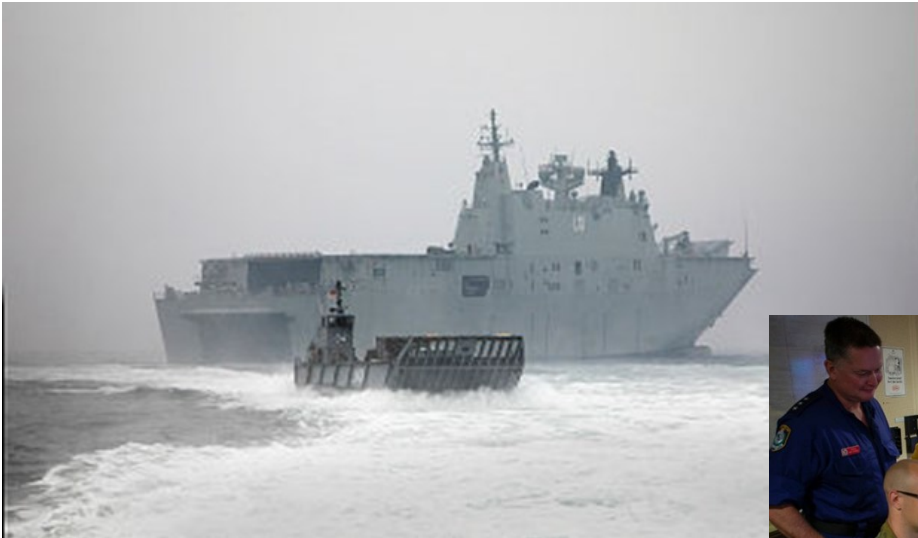
Left: One of HMAS Adelaide's landing craft at Eden, NSW during Operation Bushfire Assist 2020.