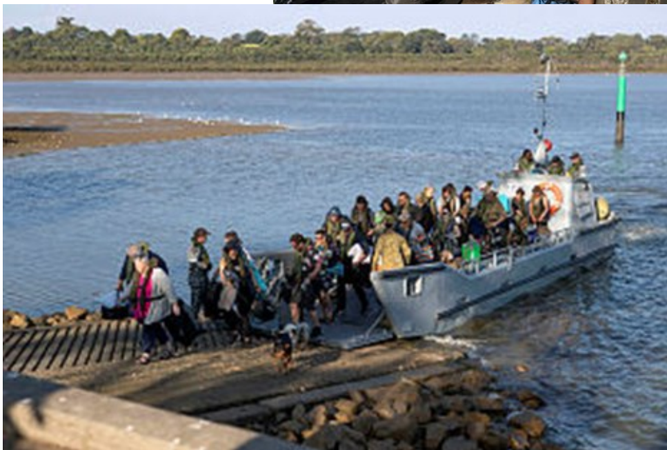
Evacuees from Mal-lacoota disembark at HMAS Cerberus Many sent other family mem-bers on the first oppor-tunity, and over the com-ing days it became clear the immediate crisis was over, but evacuation by road would not be possi-ble for some time.

When we offered the sec-ond opportunity on our return, most visitors and some residents took it up, and we were also pleased to be able to assist the CFA volunteers in getting home at the end of their deployment.