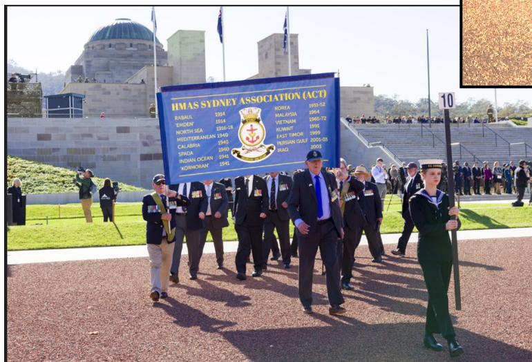
Left: HMAS Sydney' contingent made the Flickr Album as well as the Navy Communications contingent.