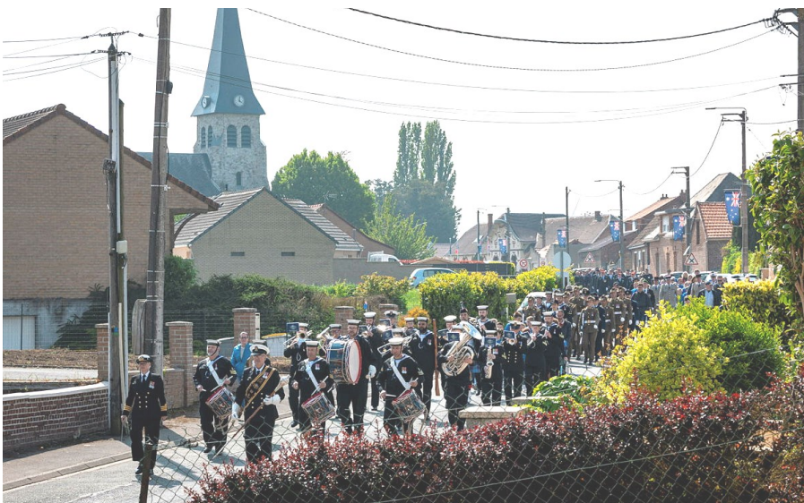
Members of Australia's Federation Guard, the Royal Australian Navy Band, French Armed Forces, veterans and members of the public march down the streets of Bullecourt for Anzac Day 2025 in France.