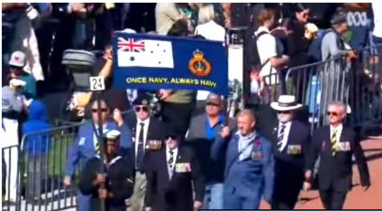
Above: NAA ACT Section contingent marching past and at right; forming up to commence the march past